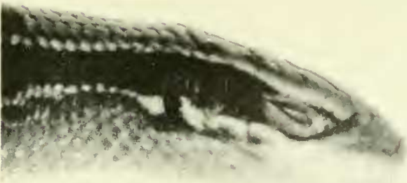
Pl. LXXV. Lateral views of the head and neck of a specimen of the two subspecies of Eumeces anthracinus . Upper, E. a. pluvialis , UIMNH 16332, five miles east of Baxter Springs, Cherokee Co., Kansas, snout-ear length 8.8 mm. Lower, E. a. anthracinus , CU 3335, Connecticut Hill, Tompkins Co., New York, snout-ear length 7.5 mm.